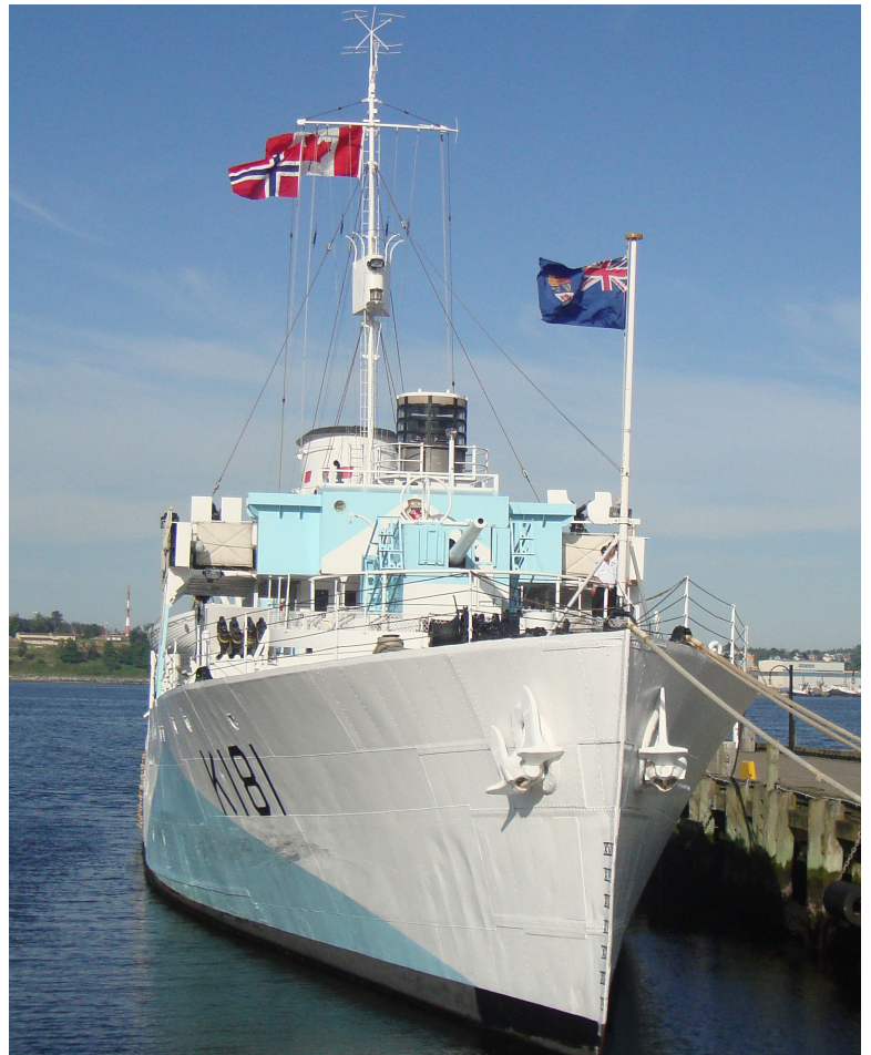
HMCS SACKVILLE paid respects and sympathy to her longtime ally by hoisting the Norwegian flag following the recent tragic events in Norway.