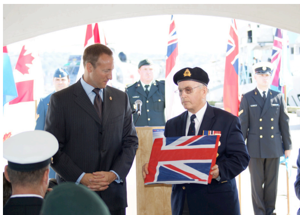
The Honourable Peter MacKay, Minister of National Defence made the official announcement on behalf of the Government of Canada and during the ceremony presented our captain, Cdr, ret'd Wendall Brown with White Ensign.

HMCS SACKVILLE played an official role during the restoration ceremony of the historic names of the three “branches” of the Canadian Forces; the Royal Canadian Navy, the Royal Canadian Air Force and the Canadian Army, in HMC Dockyard Halifax, 16 August.