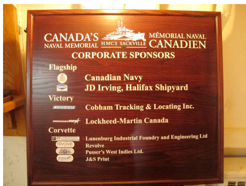
In July 2011, corporate sponsors have a new place of honour onboard SACKVILLE with the unveiling and mounting of a decorative display.