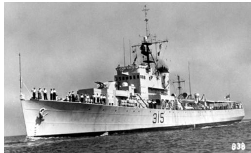
HMCS New Glasgow

January 30, 1911 His Majesty King George V allows the use of “Royal” for the Canadian Navy, and the abbreviation becomes RCN.