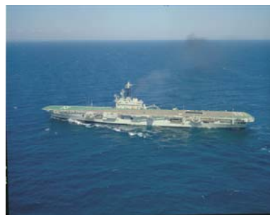
HMCS Bonaventure