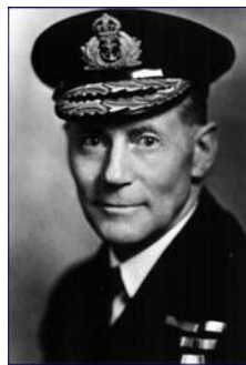
RAdm. Walter Hose

In response to the changing requirements of imperial naval defence, Halifax, Nova Scotia, and Esquimalt, British Columbia, are no longer needed by the Royal Navy. The dockyard in Halifax transfers to the Dominion of Canada on this date. However, the terms of transfer are not considered appropriate, and renegotiations take place. The transfer is not completed until March 1908.