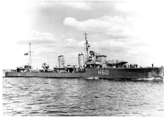
The destroyer HMCS Ottawa (H60) circa 1940