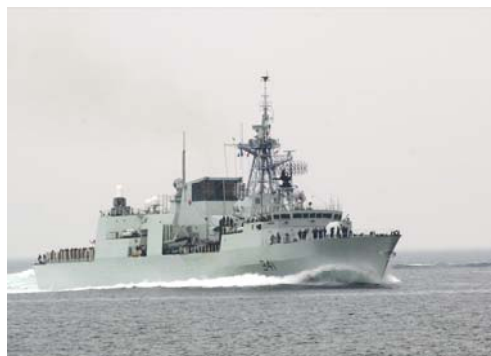
The Frigate HMCS Ottawa (341)