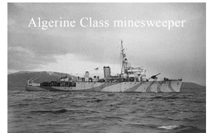
Algerine Class minesweeper

24 Jun 1943– HMCS Sault Ste. Marie (J334), the first of the Algerine Class minesweepers commissions. She is paid off on 1 Oct 1958.