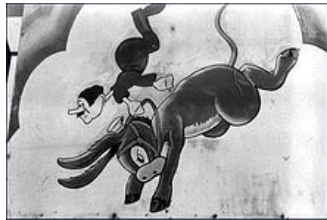
Gun shield art showing HMCS Buctouche 's unofficial badge

05 Jun 1941– The Flower Class corvette HMCS Buctouche (K179) commissions into the Royal Canadian Navy. She is paid off 17 Jun 1945.